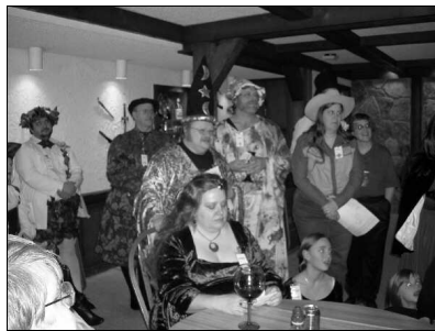
Observing the Hidden Council meeting of the Immortal Clans.

The Were clan appeared to have much discord within their ranks. It appears that the leader of the group, Bastet, had been under some type of mind control for many years and "Not responsible for her own actions". Please, folks, do you really think that would it be possible to control the mind of a Goddess? The infighting became most apparent during the meetings of all the clans toward the end of the evening. Clan members were split as to her innocence or guilt in anything.